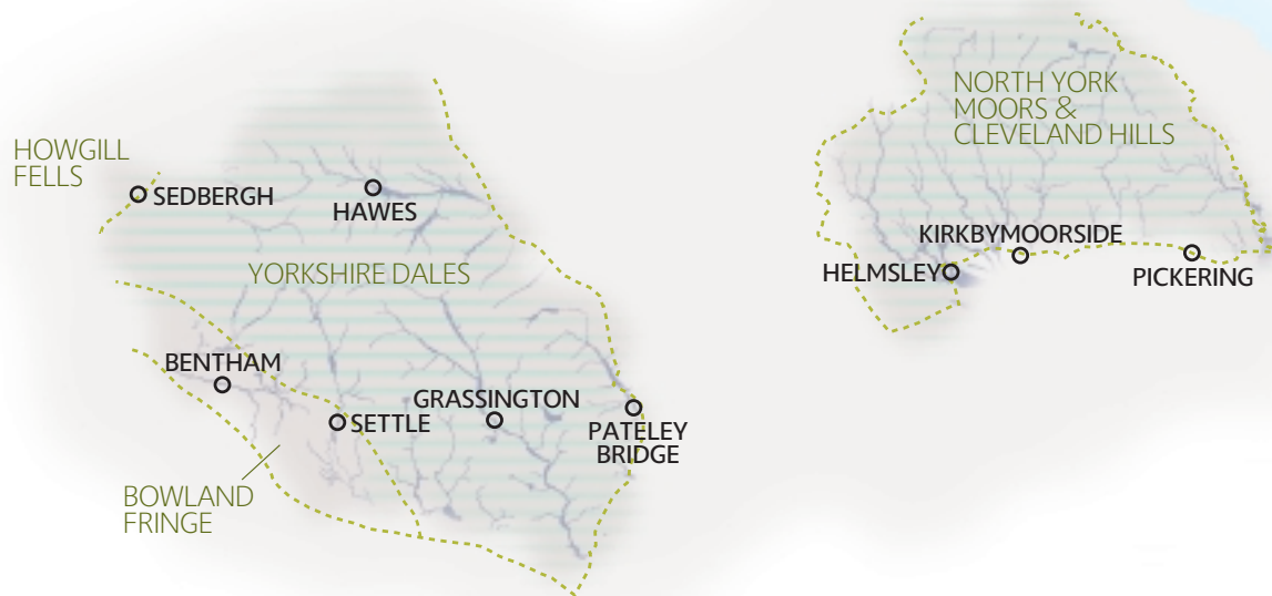
Fig. 12.1 | ENVIRONMENT MAP