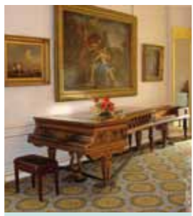
Sewerby Hall is a grade one listed building constructed between 1714-1720 by the Greame family.