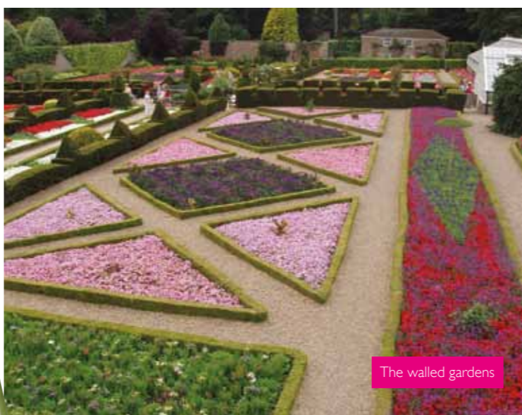
The walled gardens

Our 2011 art and exhibitions programme runs during the entire season. On show there will be the customary high standard of work from local artists new to Sewerby Hall and Gardens. Exhibitions include the Wagoners Special Reserve and In Brave Company, the story of building the monument to 158 Squadron at Lissett.