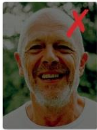
Image is too dark

Please don't send the following types of photograph, as we won't be able to use them for your bus pass.